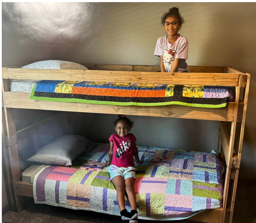
Such happy faces on the recipients of their new bed and quilt