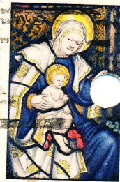
Christmas USA 15c